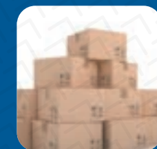
Parcel & Courier